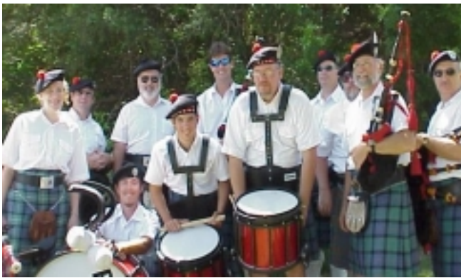
City of Melbourne Pipes and Drums Before Competing - Dunedin 2003